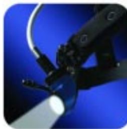
SURGILUX® FIXED SPOT Model No. 528342