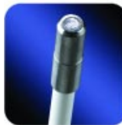
XLG™ CABLE Model No. W358XLG

New lightweight glass fiber technology maximizes light transmission.